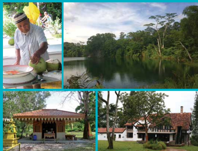
Clockwise from left: Ahmad Drink Stall, Pekan Quarry, House No. 1 and Visitor Centre, German Girl Shrine

Pulau Ubin lies on the Straits of Johor off the North-eastern coast of the main island of Singapore. It was essentially made up of five smaller islands connected by mangrove swamps. The swamps were later drained, resulting in one continuous island. In the 16th to 17th century, the island was under the control of the Johor-Riau Empire and the earliest inhabitants were the Orang Laut and indigenous Malay with Bugis and Javanese origins. The British East India Company claimed Pulau Ubin (then called Pulo Obin) in 1825 when John Crawford, Singapore's second British Resident, led an expedition to the island from Singapore. Pulau Ubin was later described as an important island that commanded the entrance of the "highway for all vessels trading to China and the far east".