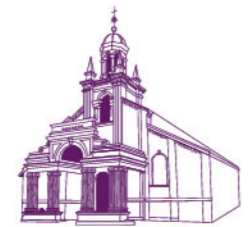
ORCHARD ROAD PRESBYTERIAN CHURCH