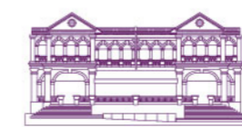
WINSLAND HOUSE II