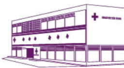
RED CROSS HOUSE