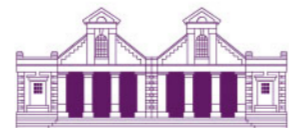
FORMER ORCHARD ROAD MARKET