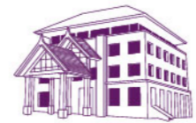
ROYAL THAI EMBASSY