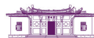
HOUSE OF TAN YEOK NEE