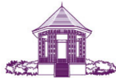
SINGAPORE BOTANIC GARDENS