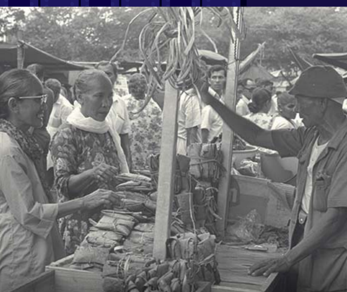
A tempoh (Indonesian soy dish) seller attending to customers at Tekka Market, 1971