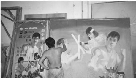
Movie poster painter