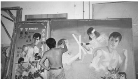
Movie poster painter

- Services of painters are no longer required. Instead, designers will use computer software to design and print the posters.