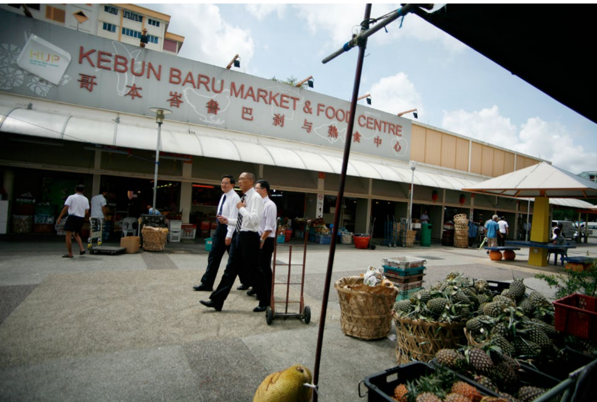
▲ The façade of Kebun Baru Market and Food Centre (2012).