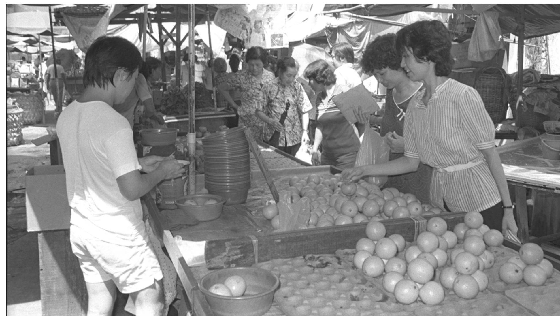
▲ A fruit stall at the Chinatown Market (1983).

Due to the relatively short daytime operating hours of most wet markets (usually between 6am to 2pm), prices of fresh produce can also see variations within the course of a day. By late morning or mid-day, some stall holders will reduce prices so as to cut their losses and maximise sales before they close for the day.