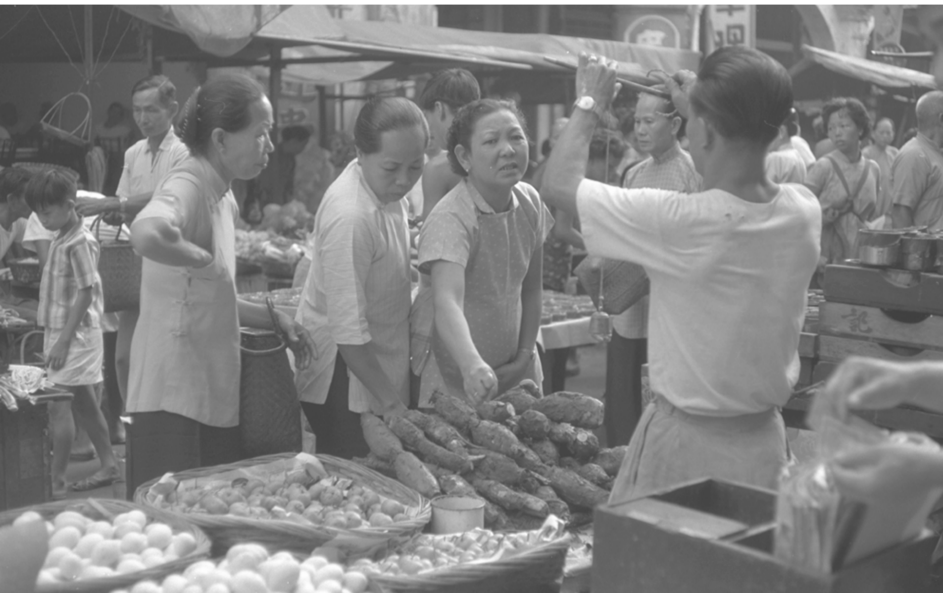
▲ A vegetable stall at Chinatown Market (1962).