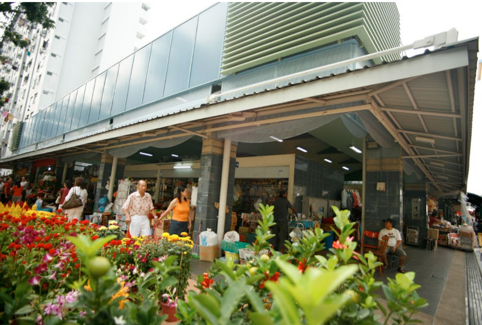
▲ The façade of Marine Terrace Market (2012).