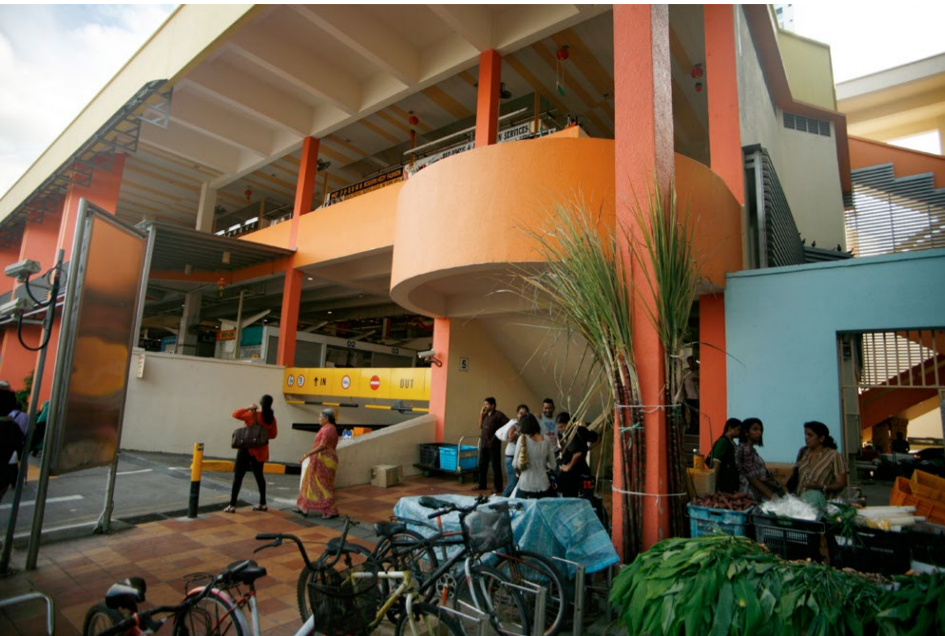
▲ The façade of Tekka Market (2012).