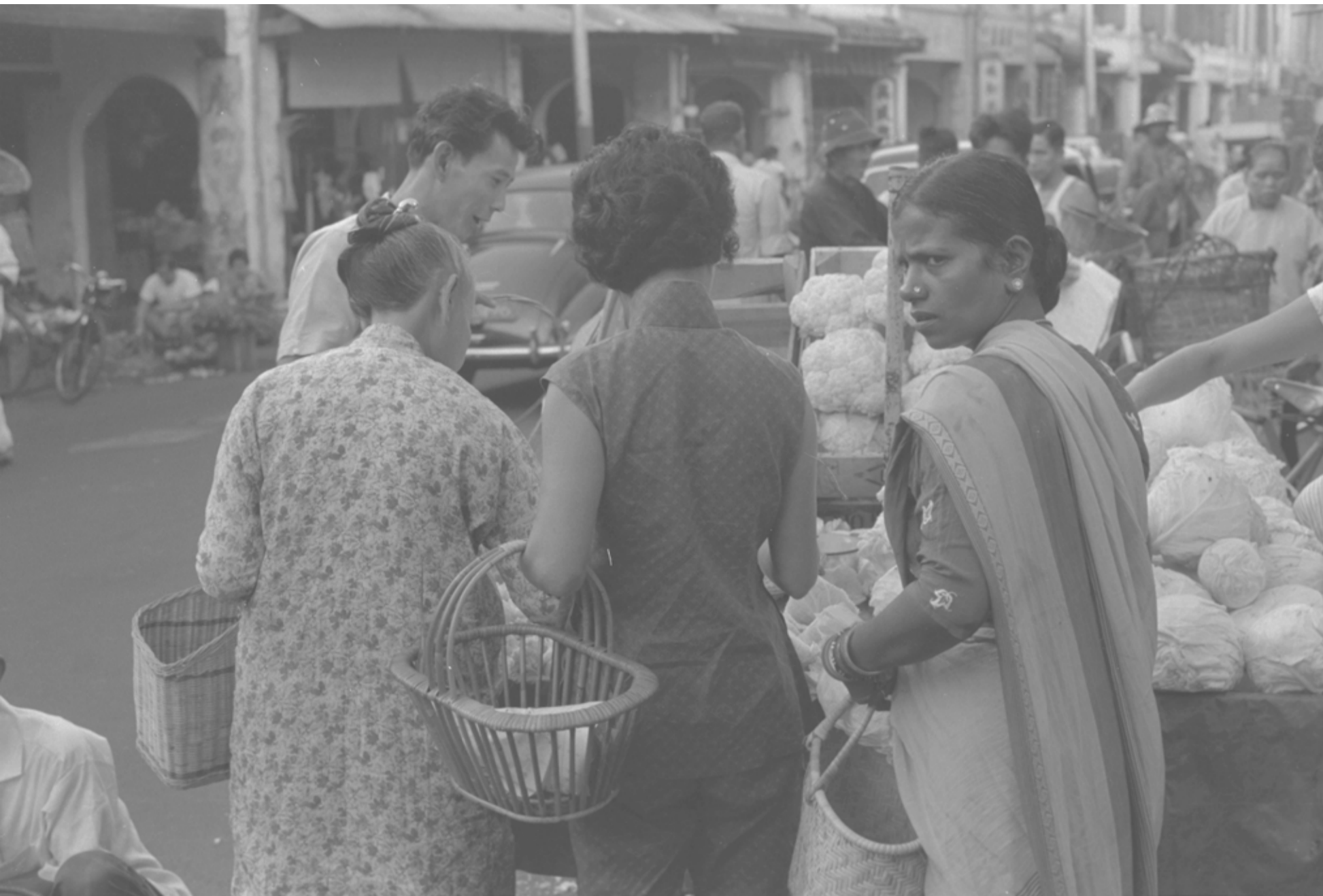
▲ Housewives from different ethnic communities patronising a market stall (1962).