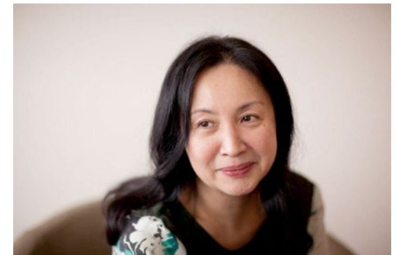
▲ Ms Yeoh Chee Yan Permanent Secretary for Ministry of Culture, Community and Youth

I am delighted that the National Heritage Board (NHB) has embarked on a series of imaginative projects to capture various aspects of Singapore's heartland heritage. I am equally delighted that their second project focuses on wet markets in Singapore. In several ways, wet markets are part and parcel of the Singaporean way of life.