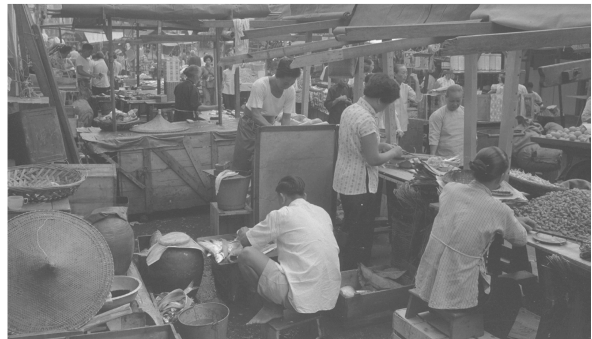
A busy day at Chinatown Market (1962). K F Wong Collection, courtesy of National Archives of Singapore ▼

Since the 1990s, over 100 markets cum hawker centres had been built. To date, Singapore has 107 wet markets and hawker centres in total and they are located in different parts of Singapore, making them accessible to all Singaporeans.