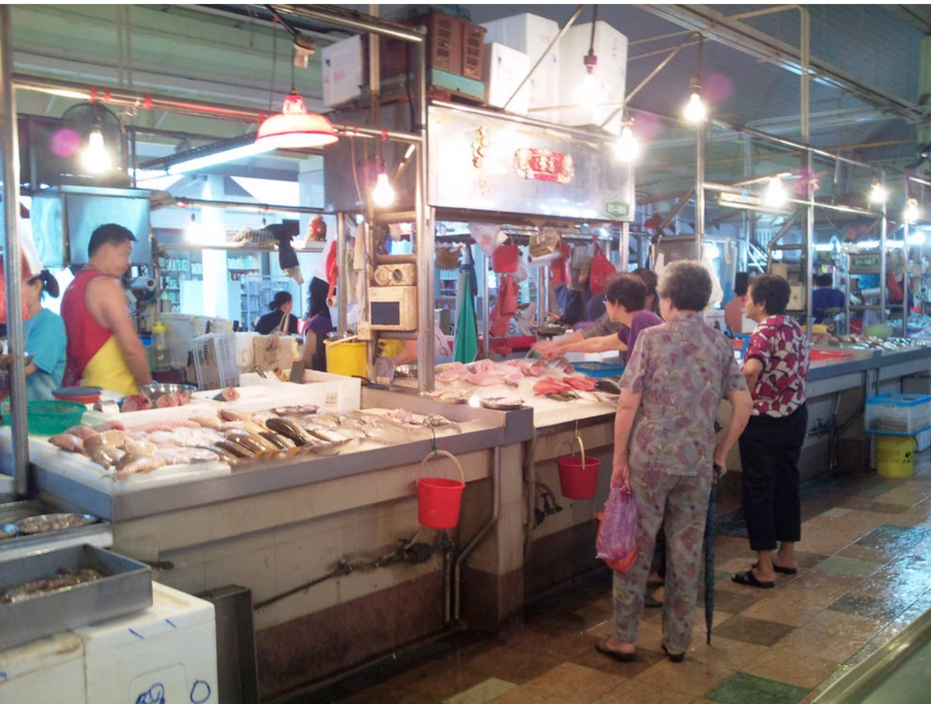
▲ The wet market section at Chong Boon Market and Food Centre (2011).