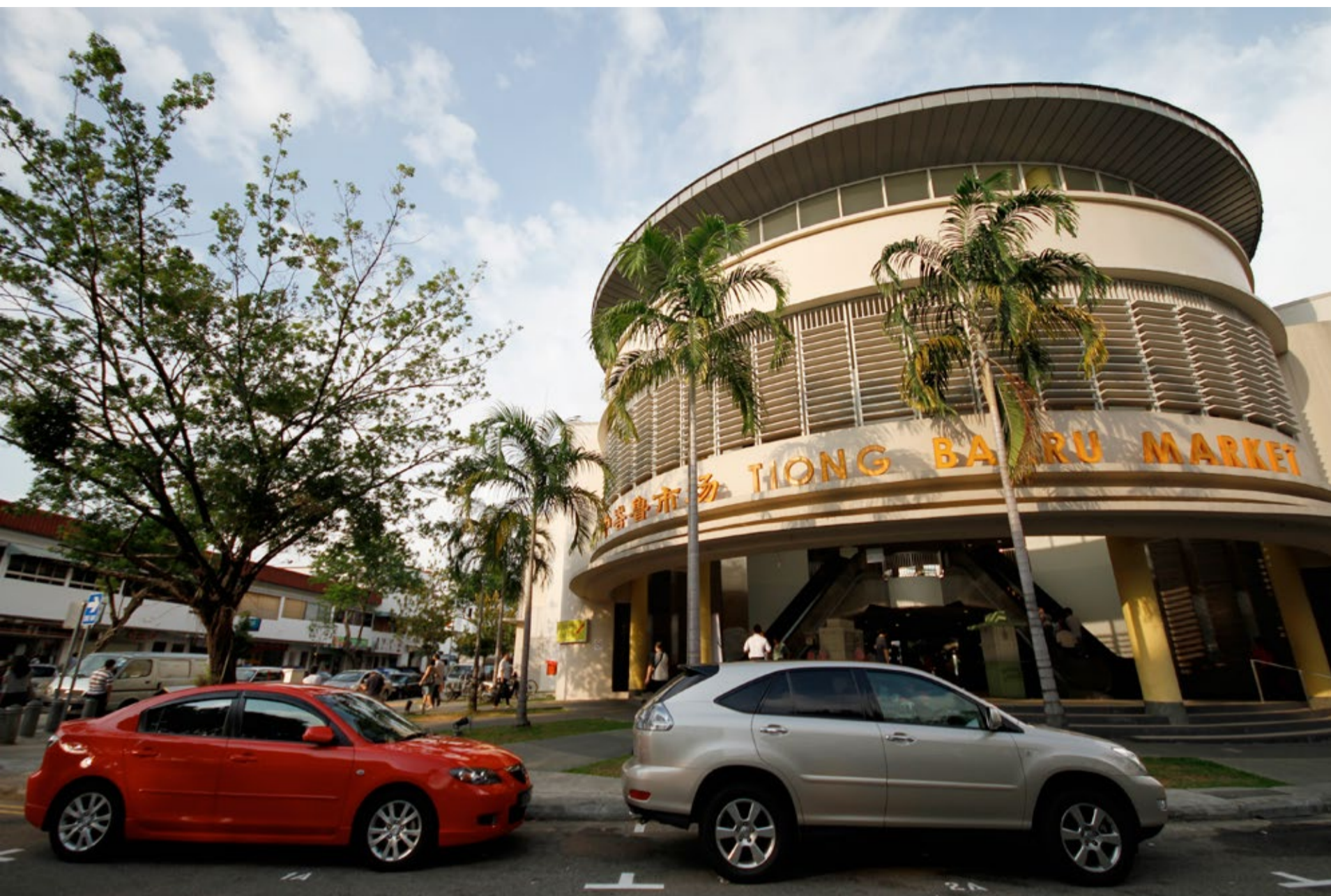
▲ The façade of Tiong Bahru Market (2012).