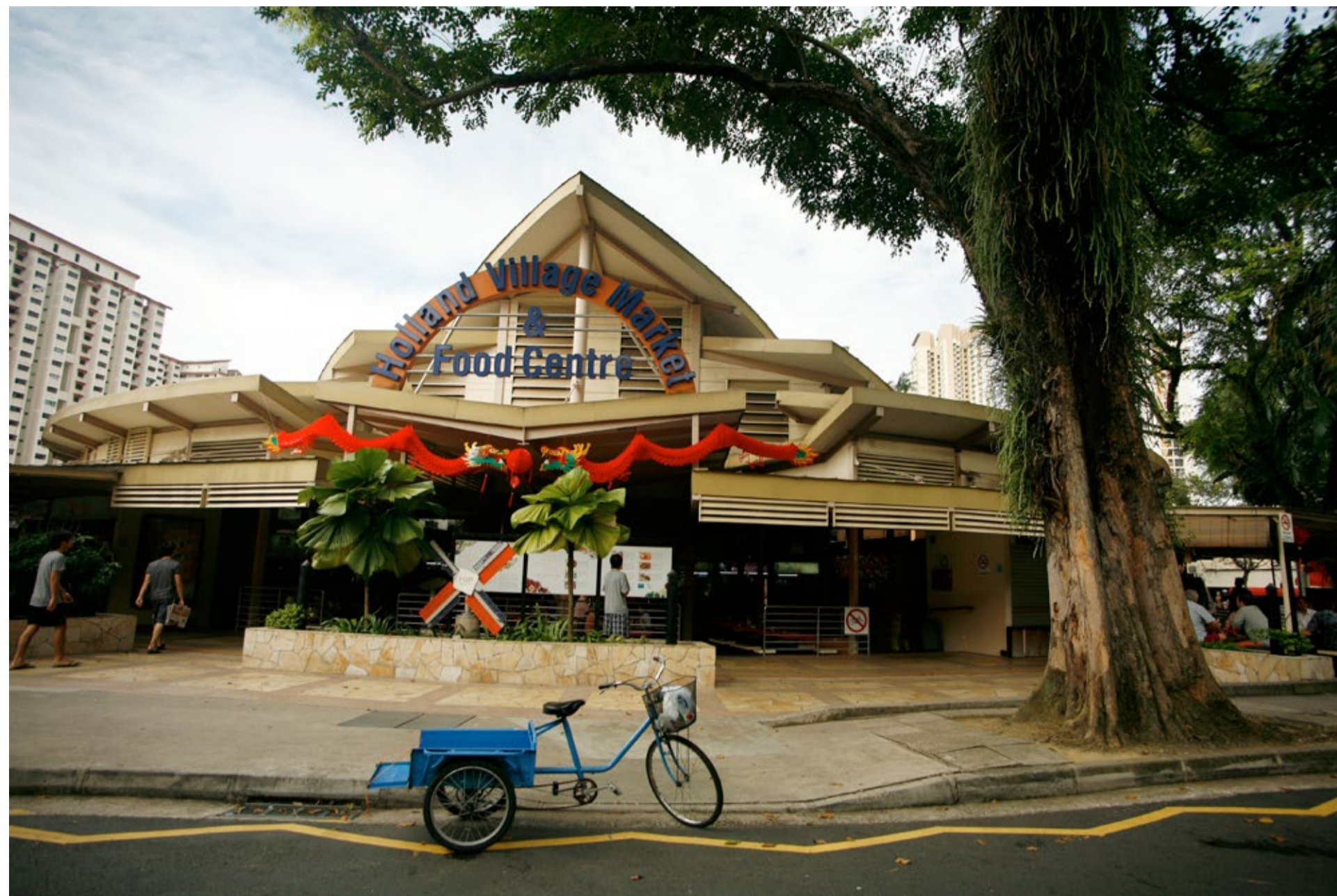
▲ The façade of Holland Village Market and Food Centre (2012).