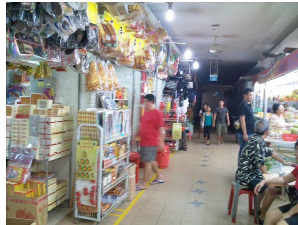
◀ The dried goods section at Tiong Bahru Market (2011).

Wet markets meet the basic needs of Singaporeans and are a source of livelihood for their stall holders. They have also become a common ground for Singapore’s ethnically diverse population to interact and bond, and contribute to Singapore’s vibrant community heritage.