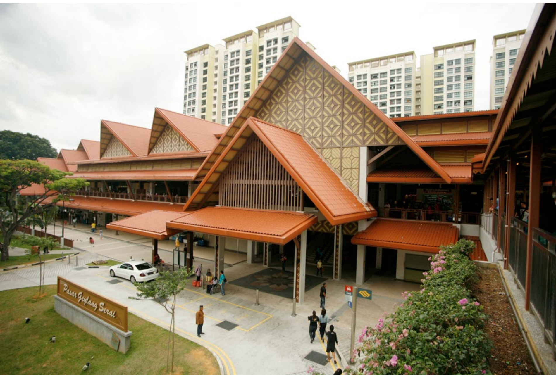
▲ The façade of Geylang Serai Market (2012).