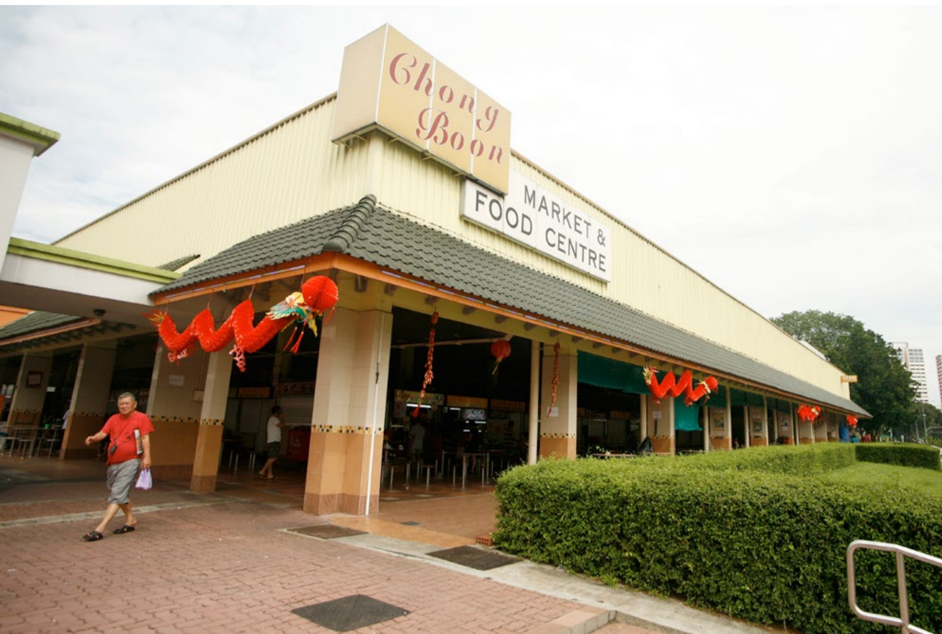
▲ The façade of Chong Boon Market and Food Centre (2012).