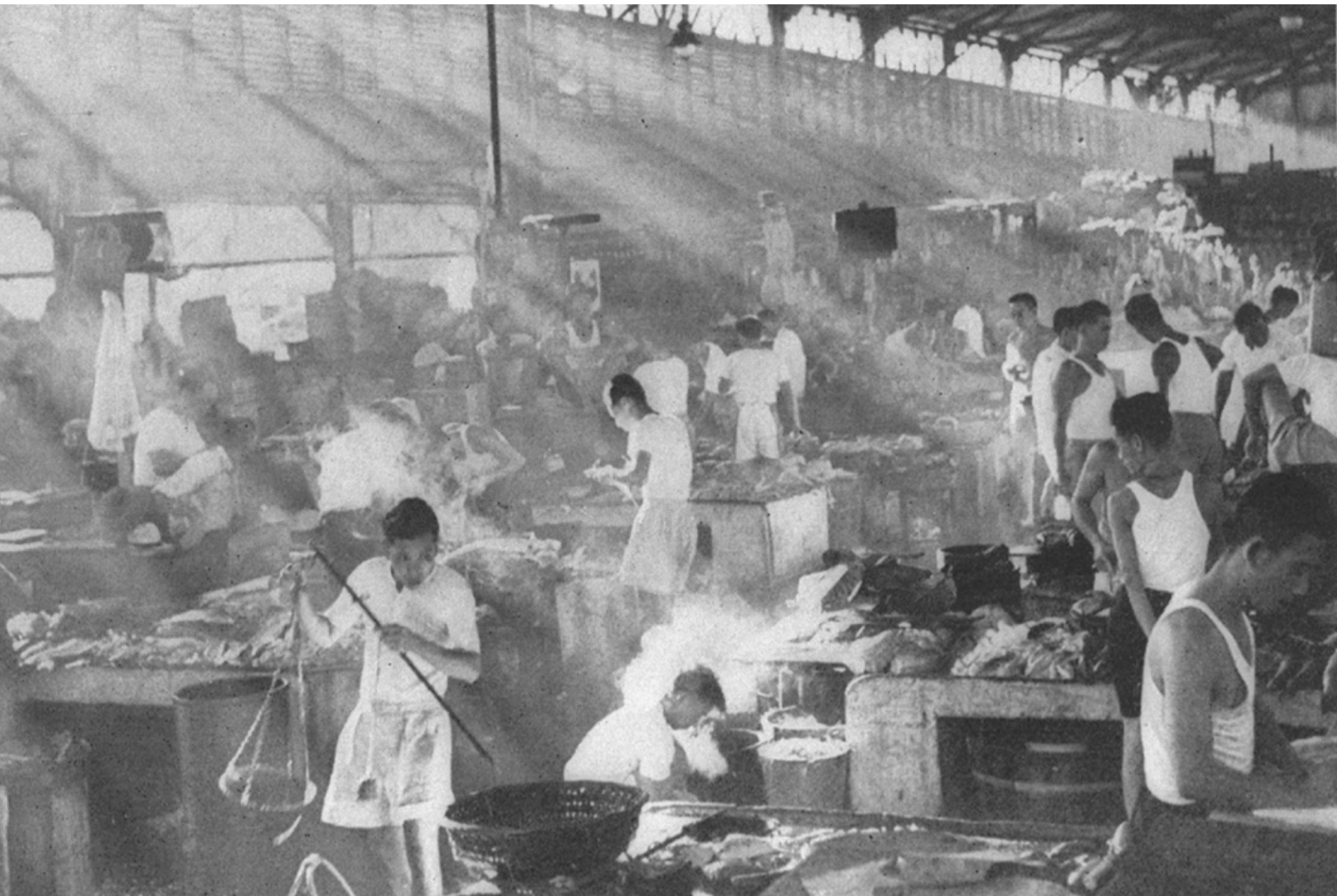
▲ The interior of the Ellenborough Market (1953).