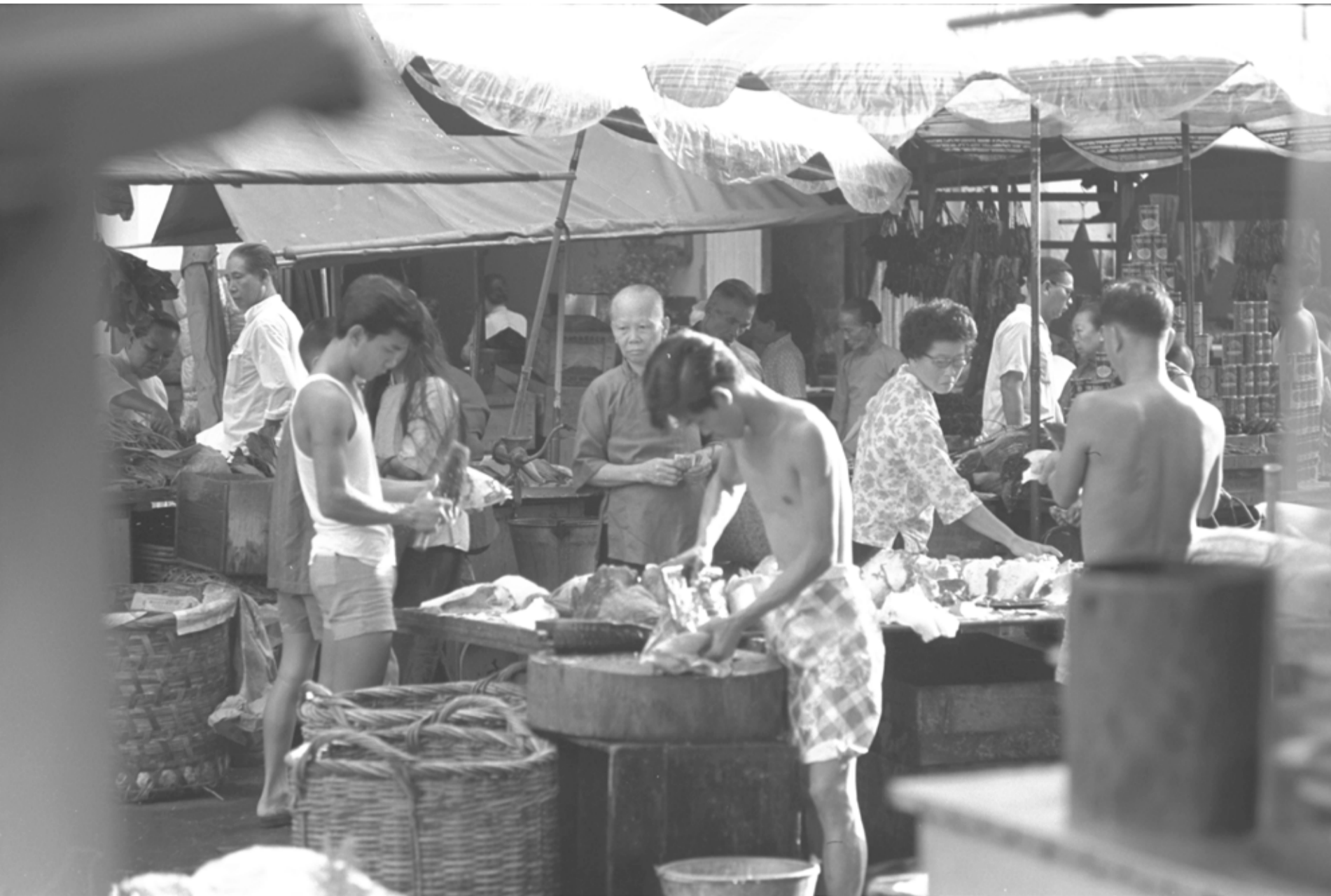
▲ A typical scene at the Tanjong Pagar Market (1960).