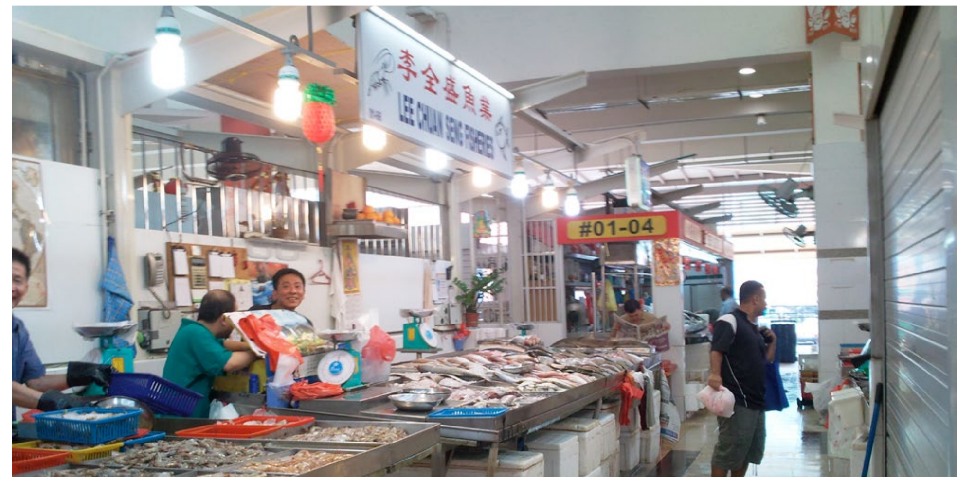
▼ A fresh selection of fish on sale at Tekka Market (2011).

In addition, stall holders also find it difficult to hire reliable staff who are willing to bear with the physical labour and odd hours of the job. As such, many stall holders choose to sell off or close down their stalls when they find that they can no longer cope with the daily operations of the business.