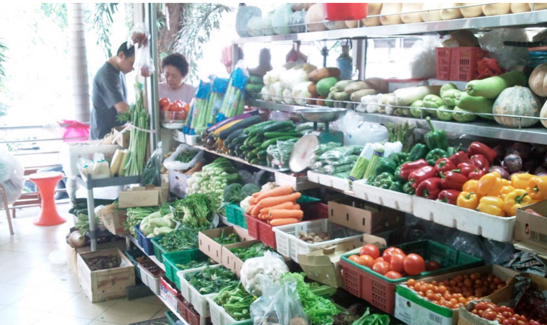
▲ A colourful array of fresh vegetables at this stall in Holland Village Market and Food Centre (2011).